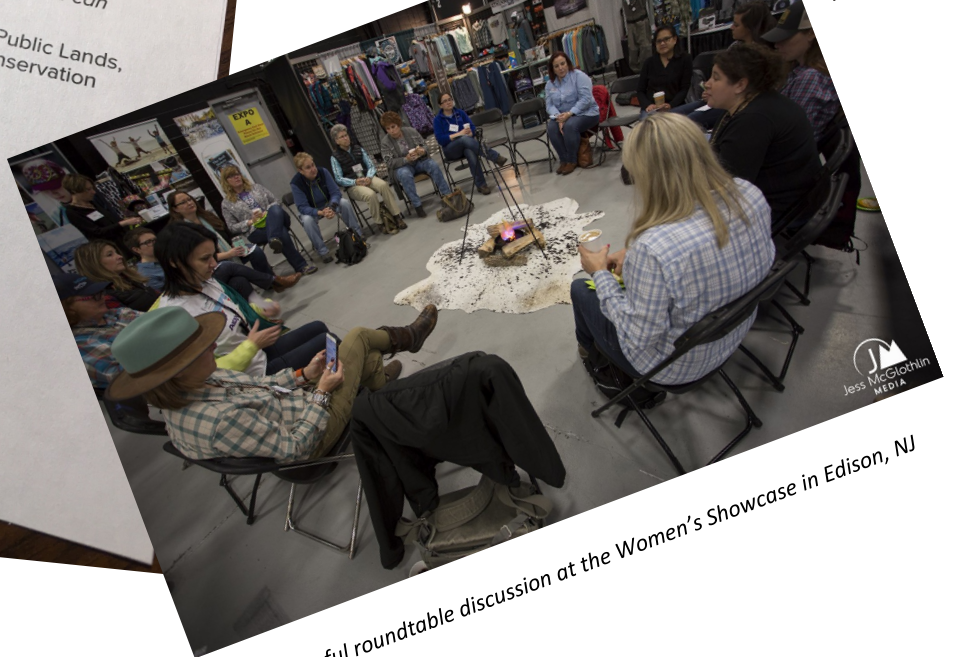
Successful roundtable discussion at the Women's Showcase in Edison, NJ