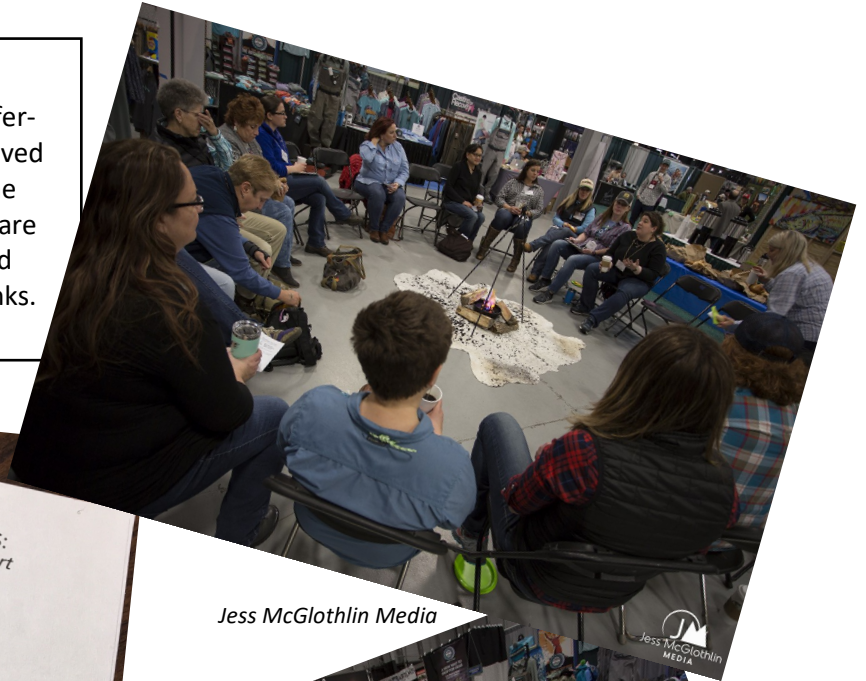
Jess McGlothlin Media

Below are five websites to visit and make a difference. These sites make it easy to become involved in conservation issues that threaten our pristine waters and geographic locations. Be sure to share with friends and spread the word. It's quick and easy to stand up with these digital advocacy links.